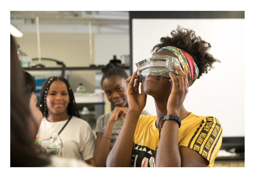
Maker Lab student tries out the project of two STEAM Up! students as they look on.

The applications for all of our summer programming for secondary students are due on March 15th. Please encourage any bright and motivated high school students in your life to apply.