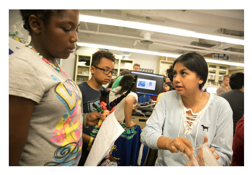
{\it Maker\ Lab\ student\ explains\ her\ project\ to\ two\ visiting\ STEAM\ Up!\ students.}